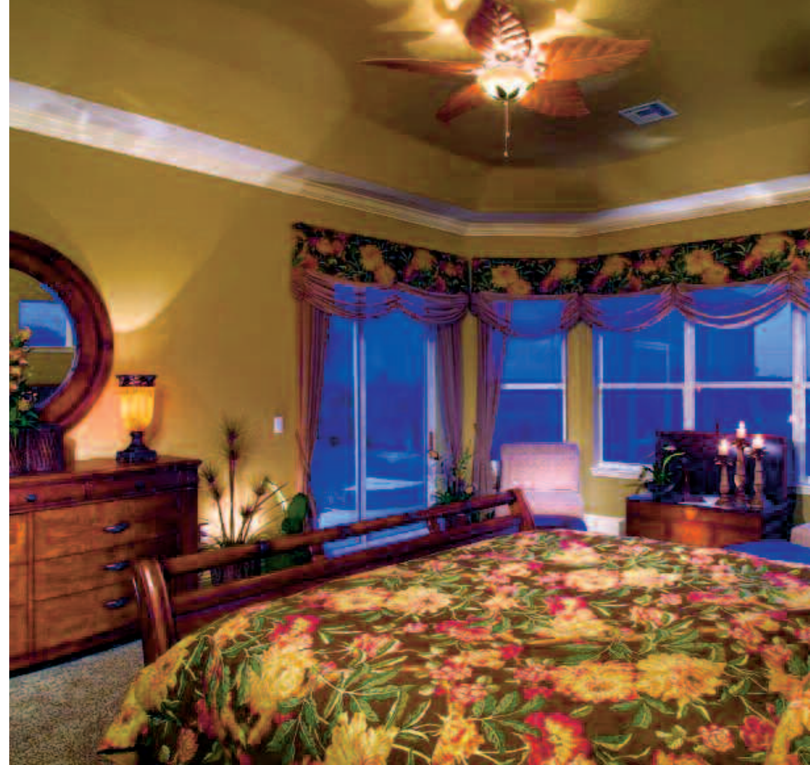
OPPOSITE – The master suite offers all of the sought-after features of today's fully equipped boudoir — bay windows (with room for a cozy seating area), eight-foot sliding glass doors and tray ceiling detail.

a more subtle, soothing palette, with plush taupe carpeting and a pastoral trompe l'oeil accenting the alcove. (This same misty vignette is echoed in the nearby powder room.)